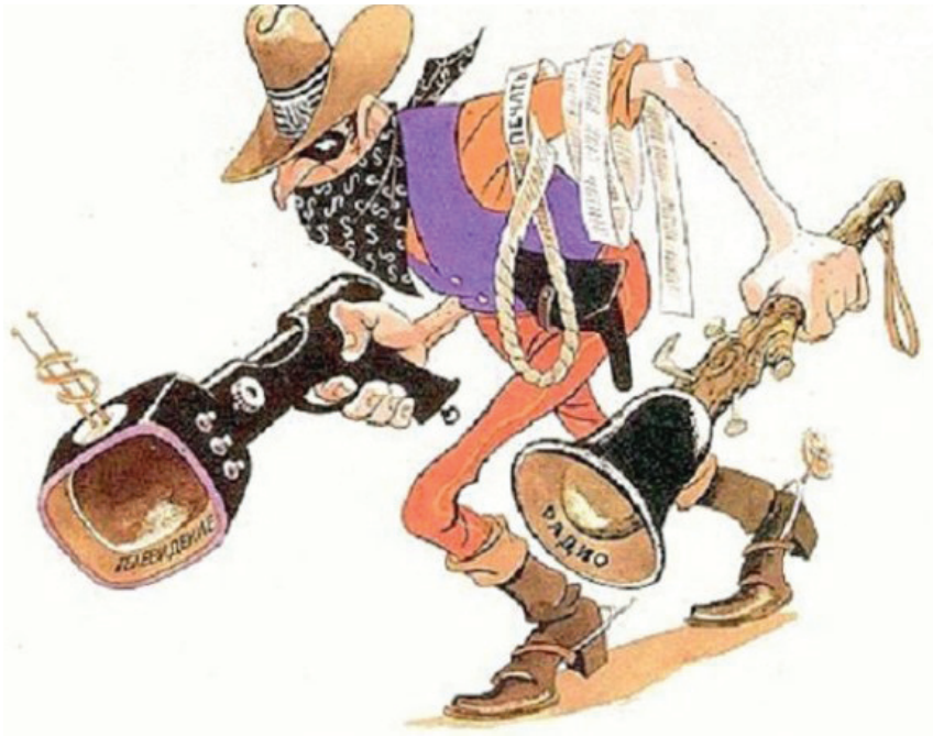
Media as a tool of information warfare & the conquest of Raza minds

and oppressed communities that are raising a clenched fist and yelling until it echoes through the corner of every barrio "YA BASTA." The theme interwoven in this issue is critical, having that we live in a time not only of mass repression and Raza Resistance, but of mass disinformation and vendido politics disguised as "mobilization." Just as the Prison Industrial Complex makes a killing off of killing and imprisoning us, the Non-Profit Industrial Complex fattens its budgets by pretending to act as go-betweens, but in reality are acting as the scouts for the forces of repression who criminalize our community. It is nearly impossible as the media acts uncritically like ride-alongs and reports the so-called news from the perspective of the goons who occupy our barrios. We have yet to see anyone report the news on police repression from the side of the repressed, and can only watch as our "leaders" clamor for us to not do things that provoke the police to beat us, much like telling a victim of rape not to provoke the rapist!